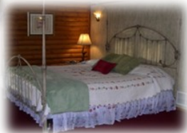
A Premier Dubuque Area Bed and Breakfast

For more information: www.quietwalkerlodge.com 1-800-388-0942